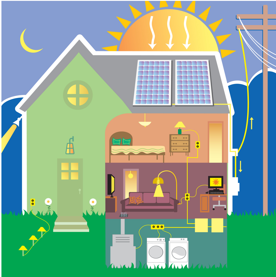
Figure 3: PV production and net load for a sample residential NEM customer