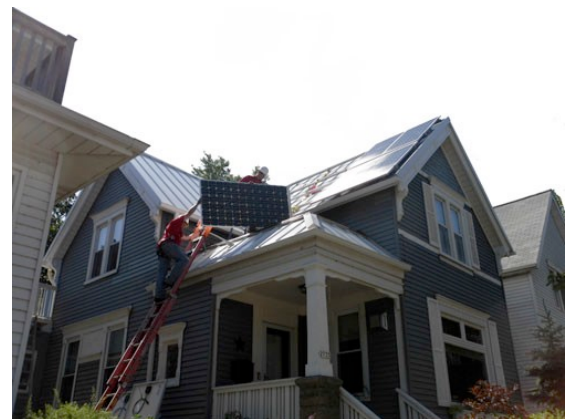
A Milwaukee solar group buy resident installation.

Asking good questions before committing to buy a solar electric system helps protect you from potential hazards and liabilities associated with having a solar energy system installed on your building or home. Use the following questions to ask a Solar Energy Contractor prior to committing to buying a solar electric system.