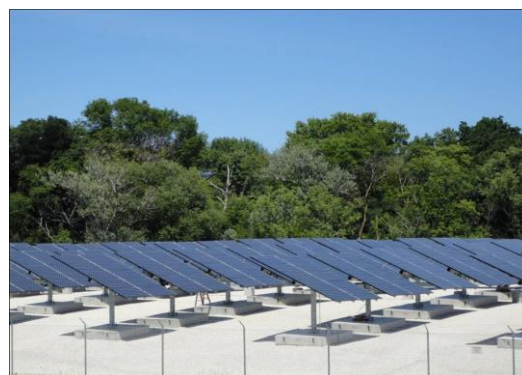
Solar Farm - MATC Blue Hole Project Located on Capitol Drive in Milwaukee.

Solar Farm: An array of multiple solar collectors on ground-mounted racks or poles that transmit solar energy and is the primary land use for the parcel on which it is located.