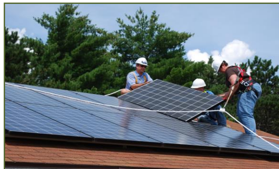
Rooftop Solar, MREA

Like any development, solar may come into conflict with other land uses, and solar resources are often co-located with other important local resources. Recognizing these issues in the comprehensive plan can help to mitigate future problems.