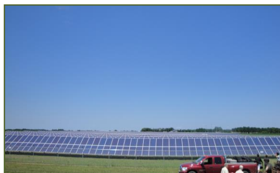
Solar Farm, CERTs