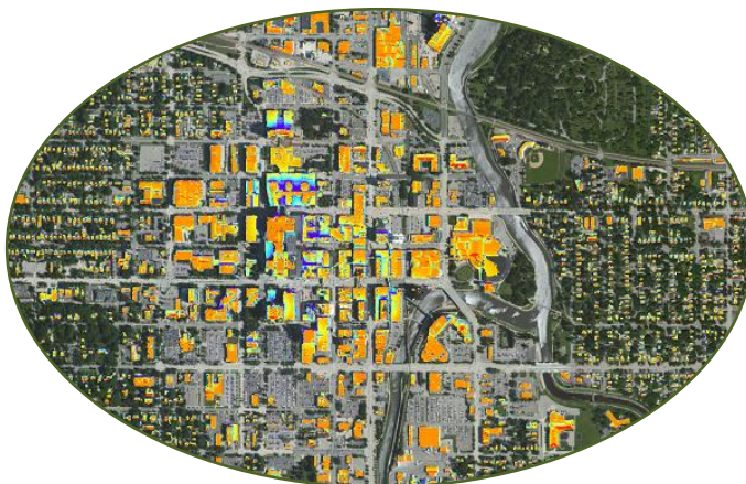
Downtown Solar Resource Map. Rochester, MN

Communities are not, however, always familiar with the characteristics of solar resources and solar land uses. This document outlines considerations that communities should make and identifies elements that allow for clear priorities around solar energy objectives. Identifying how solar development can benefit the community will help decision-makers determine how solar resources and investments are integrated into the community in a way that balances and protects competing development or resources.