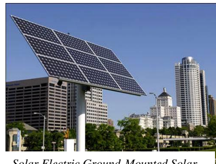
Solar Electric Ground-Mounted Solar Array at Discovery World

Solar Farm: An array of multiple solar collectors on ground-mounted racks or poles that transmit solar energy and is the primary land use for the parcel on which it is located.