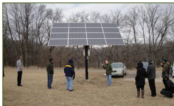
Ground Mount System, CERTs