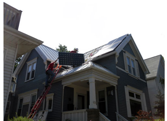
A Milwaukee solar group buy resident installation.

Asking good questions before committing to buy a solar electric system helps protect you from potential hazards and liabilities associated with having a solar energy system installed on your building or home. Use the following questions to ask a Solar Energy Contractor prior to committing to buying a solar electric system.