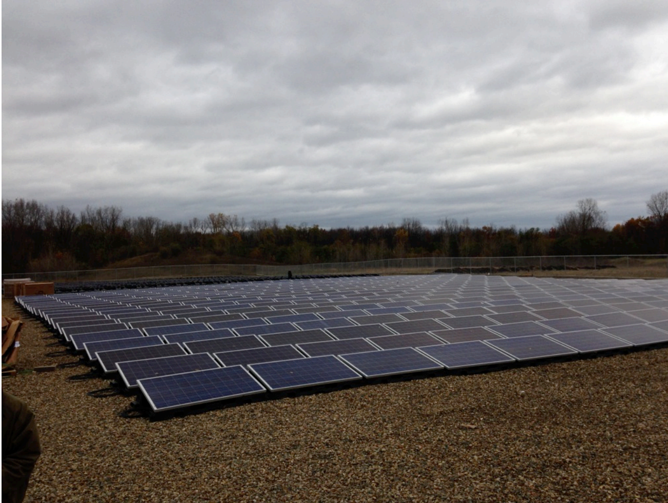
Landfill Solar in Michigan September 2014