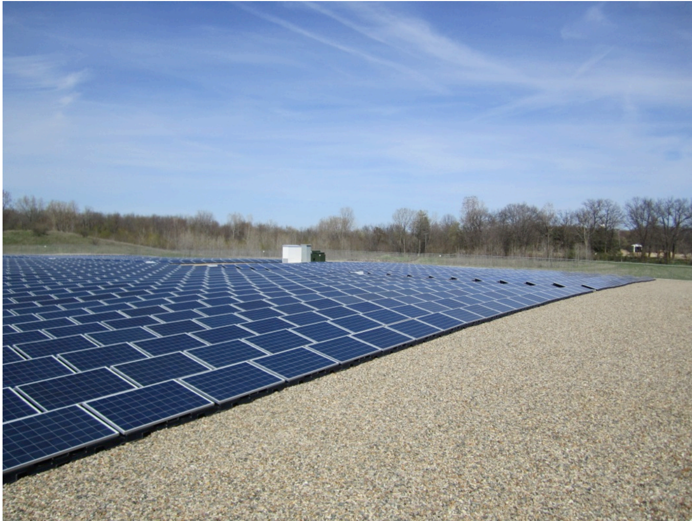
Landfill Solar in Michigan September 2014