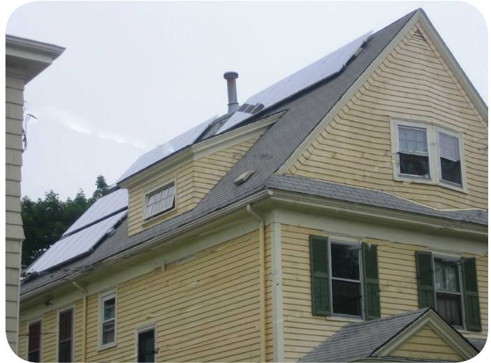
These solar panels low profile and location make them unobtrusive even though they are visible from the public right of way.