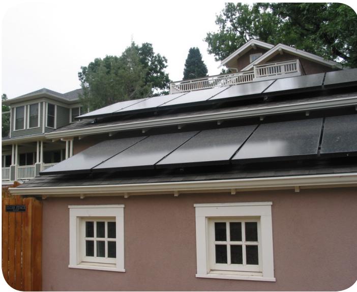
Solar panels placed on an accessory structure not visible from the public right of way should still follow the slope of the roof and have a low profile.